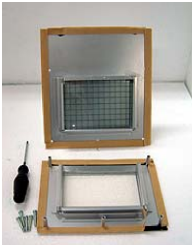
Disassembled window ready for tape backing removal and installation to door